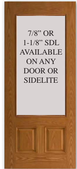
OAK TEX 3/4 LITE

7/8" OR 1-1/8" SDL AVAILABLE ON ANY DOOR OR SIDELITE