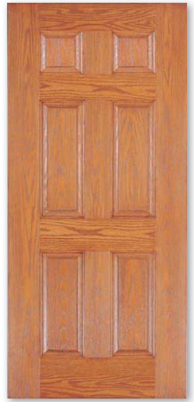
OAK TEX 6 PNL

Replace your existing wood door with a full size fiberglass door.