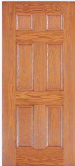
OAK TEX 6 PNL