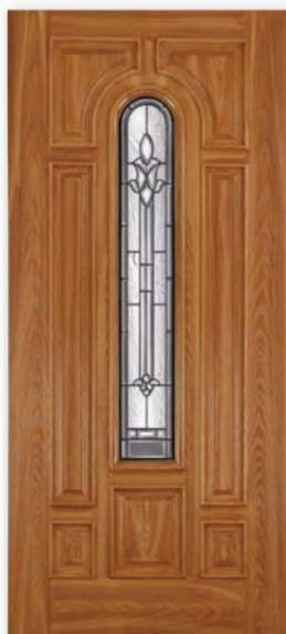
BAR204-BR2 (Antique Black Caming)