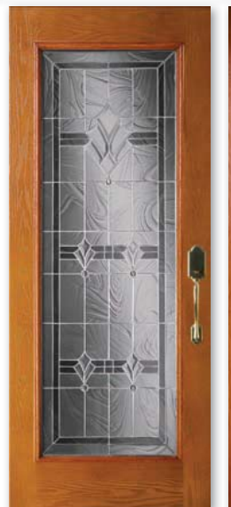
OAK TEX FULL LITE