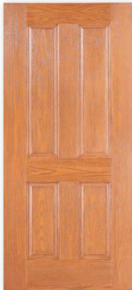
OAK TEX 4 PNL