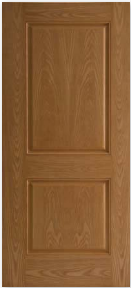
OAK TEX 2PNL SQ TOP