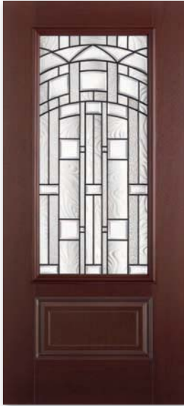
BLM 404-566-1/BLMSL 129-566-1