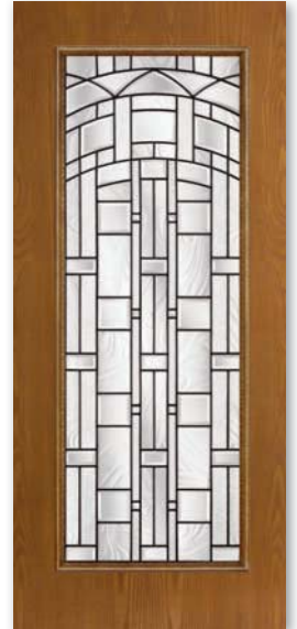
OAK TEX 122-566-X