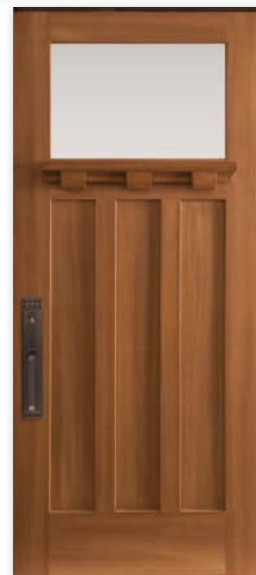
BS1 / BRCSL-609 BS1