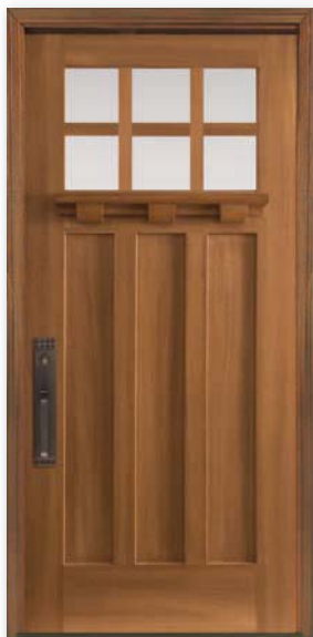
BS1 WITH SDL BARS