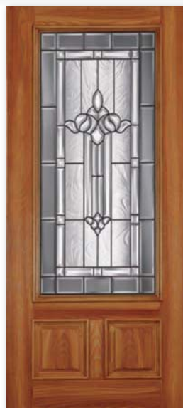
BAR 405-BR2 / BAR 451BR2 (Antique Black Caming)