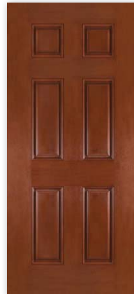
MAHOGANY 6 PNL