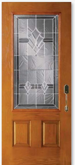
OAK TEX 3/4 LITE/2 PNL