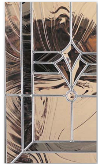
RADIANT HUES GLASS DETAIL by: ODL