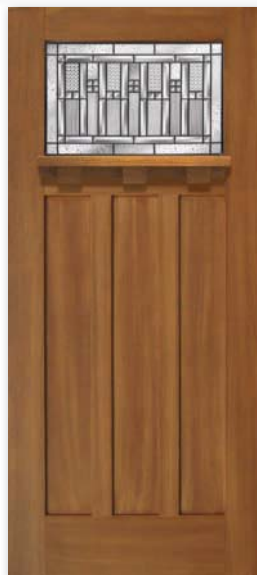
BC4 / BRCSL-609-BC4 (Ant. Black)