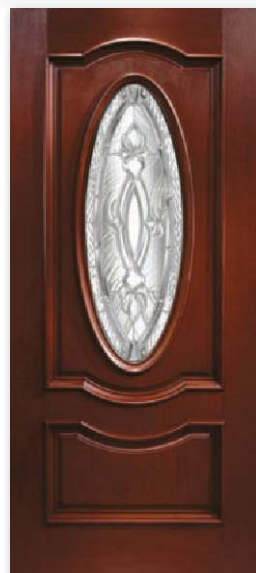
BRM 303-BR3 / BRMSL451 (Platinum Caming)