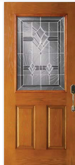
OAK TEX 1/2 LITE/2 PNL