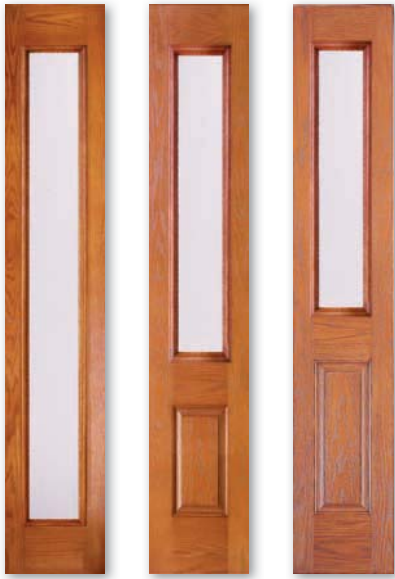
OAK TEX FULL, 3/4 AND HALF LITE SL

MASONITE STEEL AND SMOOTH FIBERGLASS DOORS CAN USE MOST OF THE DECORATIVE GLASS INSERTS SHOWN ON THIS BROCHURE (EXCEPT BARRINGTON GLASS FAMILY)