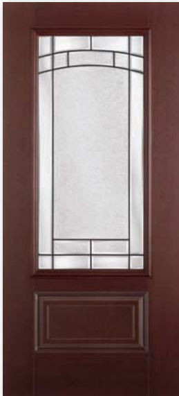
BLM 404-328-1/BLMSL 450-328-1