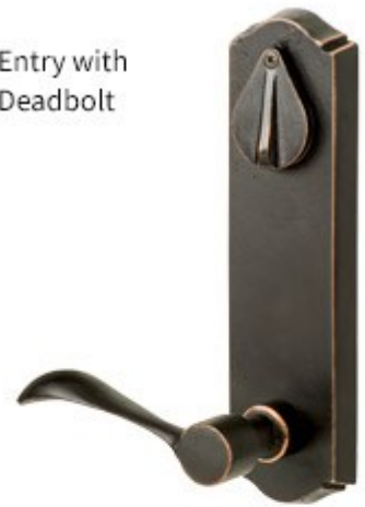
Entry with Deadbolt