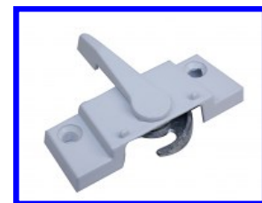
STD SASH LOCK