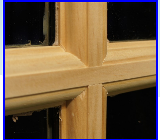
1-3/8" Inside Muntin Detail