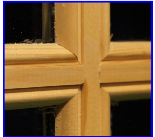
1-3/8" Outside Muntin Detail