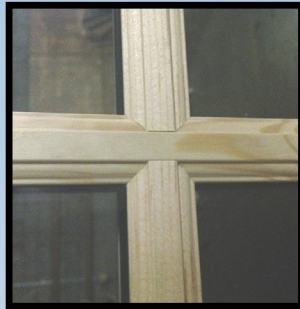
SDL Option shown in 7/8"