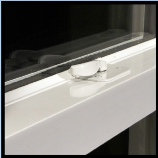
Recessed Sash Lock

The preferred choice for »» CONVENIENCE »» QUALITY »» VALUE