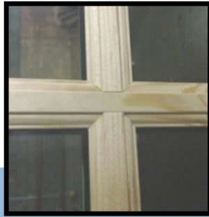
SDL Option shown in 7/8"