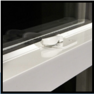
Recessed Sash Lock

The preferred choice for » CONVENIENCE » QUALITY » VALUE